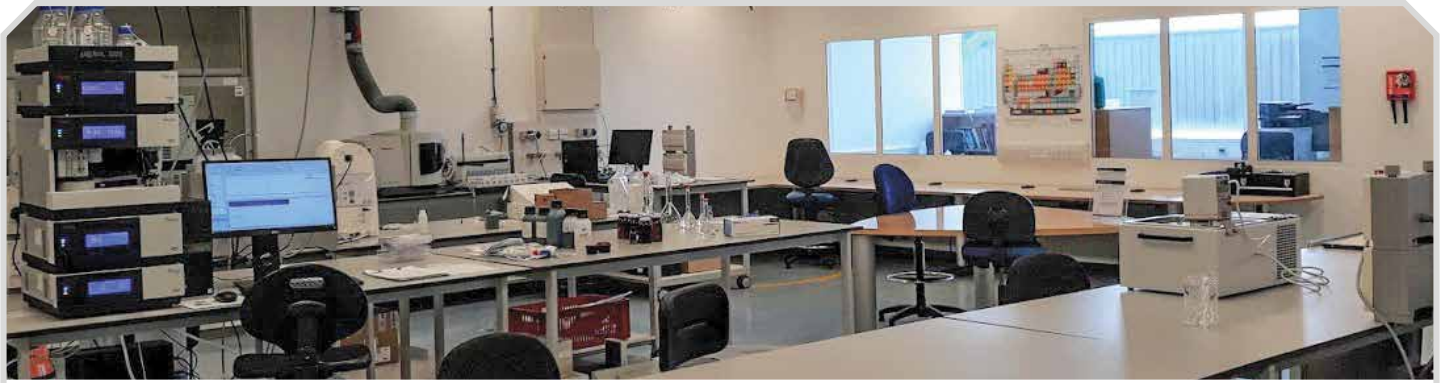
Interplex Plating R&D Centre

Interplex's Plating R&D Centre is a plating Centre of Excellence established in BioCity in central Scotland.