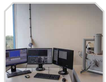
SEM & EDX